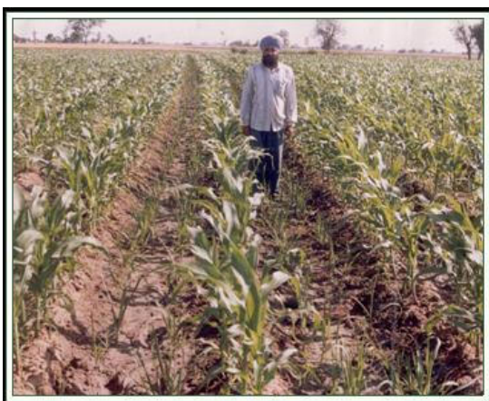
SPRING MAIZE INTER-CROP IN PAIRED ROW PLANTING

b) Paired row arrangement – It is also a rectangular arrangement. If a crop requires 60 cm x 300 m spacing and if paired row is to be adopted the spacing is altered to 90 cm instead of 60 cm in order to accommodate an intercrop. The base population is kept constant.